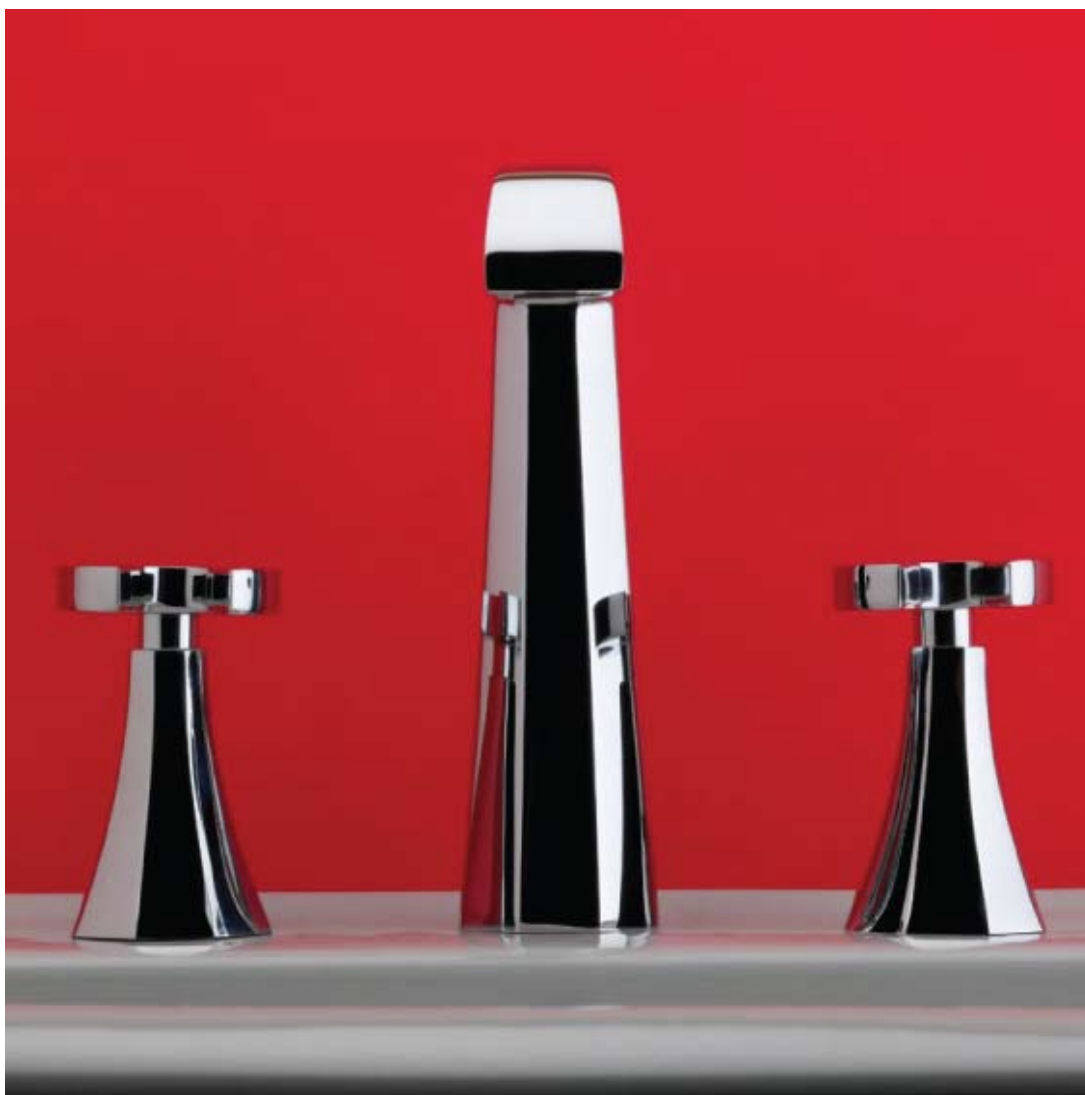
Tall Basin Set BT390