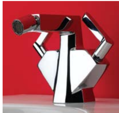
Bidet Mixer BL220