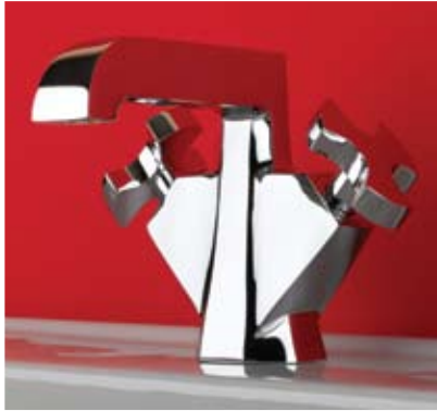
Basin Mixer BT200