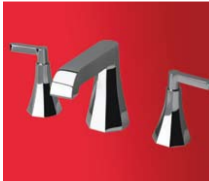
3 Hole Spout BL201