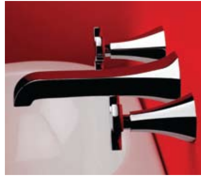
Spout BL320 WTA Set BT206