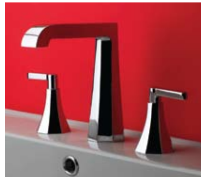
Tall Basin Set BL390