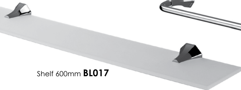
Shelf 600mm BL017