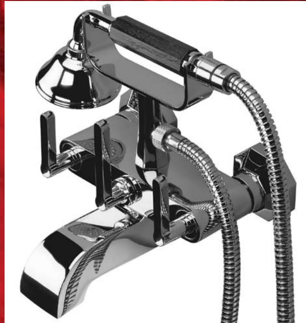
Complete External Bath BL250