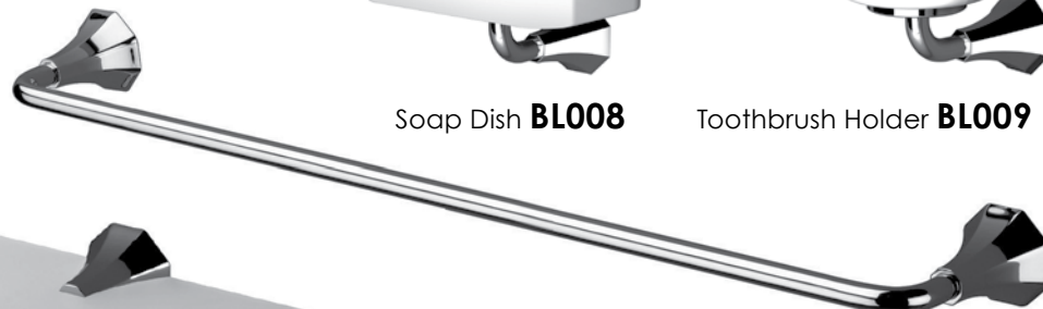
Towel Rail 600mm BL014