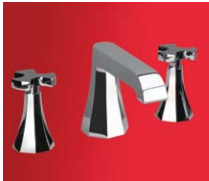
3 Hole Spout BT201