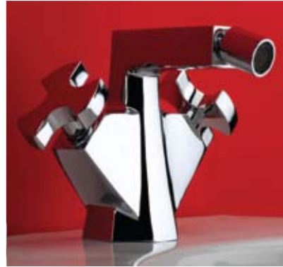
Bidet Mixer BT220