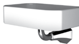
Soap Dish BL008