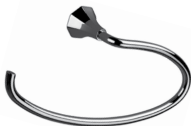
Towel Ring BL001