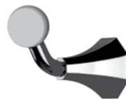
Robe Hook BL005