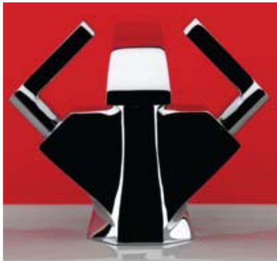
Basin Mixer BL200