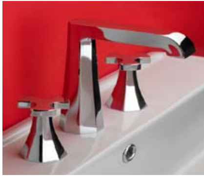
Tall Basin Set BT390