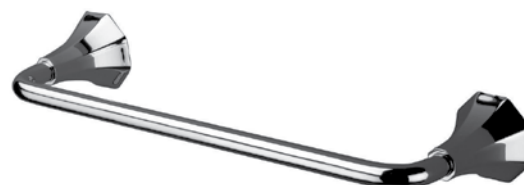
Towel Rail 300mm BL003