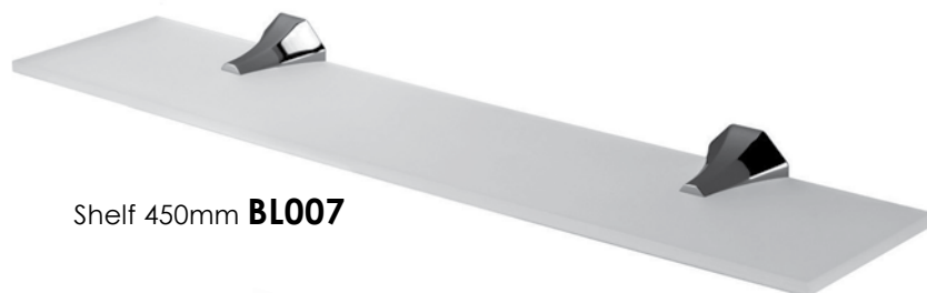
Shelf 450mm BL007