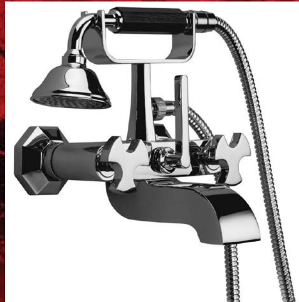
Complete External Bath BT250