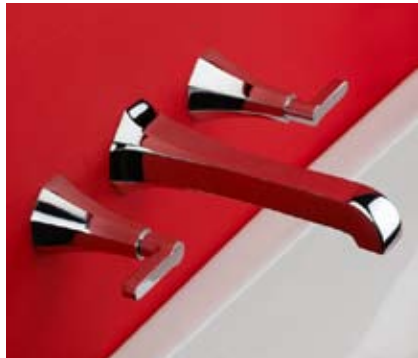
Spout BL320 WTA Set BL206