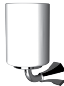
Toothbrush Holder BL009